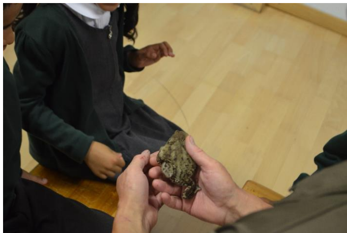
Y3 visit from the Predator Man, where they were able to get hands on with different predators

Much of our curriculum is built around the “engage, develop, innovate, express” approach of the Cornerstones resource (find out more on our website).