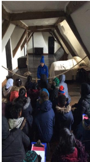
Ghost Hunting at Aston Hall