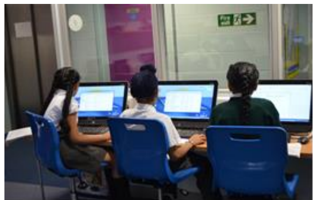
Our 32 work place ICT Suite