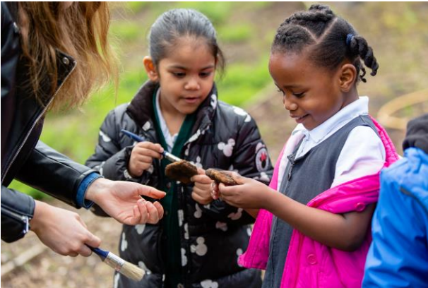
Space for outdoor learning

St. James is still one of the most modern schools in Birmingham, having been rebuilt in 2007. Children, staff, parents and members of the wider community agree that our part of Handsworth has benefitted enormously from having a school designed for 21 st Century teaching and learning.