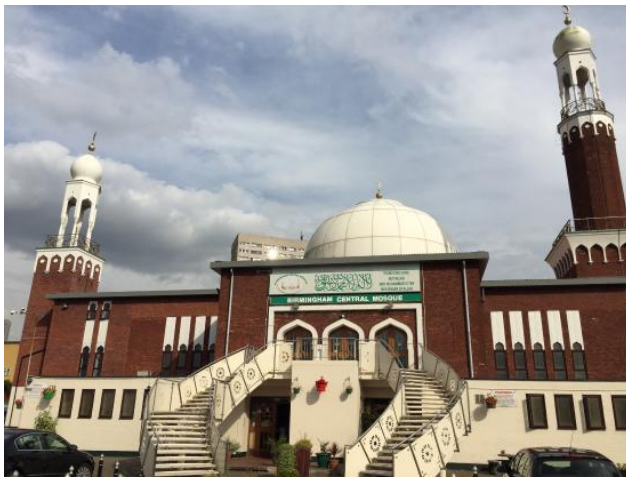
Y2 children visit Birmingham Central Mosque

We have a very strong focuses on Religious Education and Personal Social and Health Education