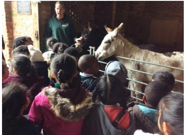
Reception visiting Umberslade Farm

We support our teaching of the curriculum with a huge range of trips away from school and visitors to the school and other exciting firsthand learning experiences.