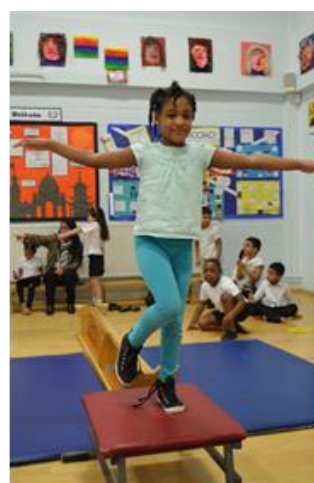
Gymnastics as part of Physical Education