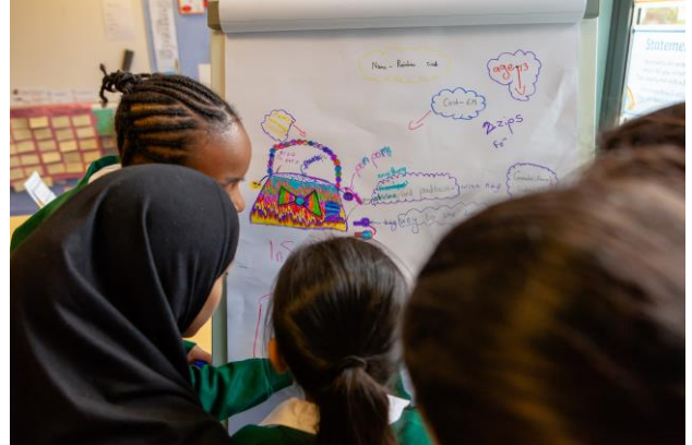
Learning beyond the core subjects