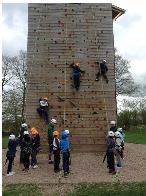
The climbing wall challenge

Every year, children in Y4 and Y6 are given the opportunity to take part in residential visits to a field centre. This provides them with the chance to take part in adventurous outdoor activities and geographical and historical fieldwork.