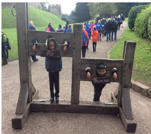
Visiting Warwick Castle as part of our Y2 Towers, Tunnels & Turrets topic