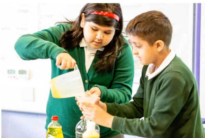
Creating a “Fountain of Gold” in a Y5 Science lesson