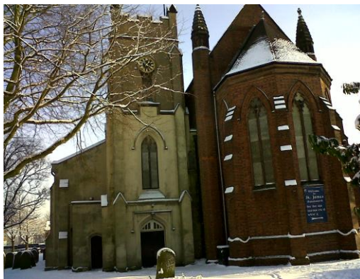
We visit St James church for Christingle and Easter

They also explore what can be learned from religion e.g. the guidance that religion gives to people in how to live their lives.