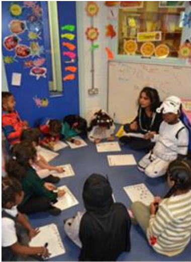
A targeted phonics group in Reception

We use this information to plan the next learning steps for individual child and for groups of children. These learning steps are identified with highest realistic expectations. There has been some brilliant work done by parents to support their children's learning.