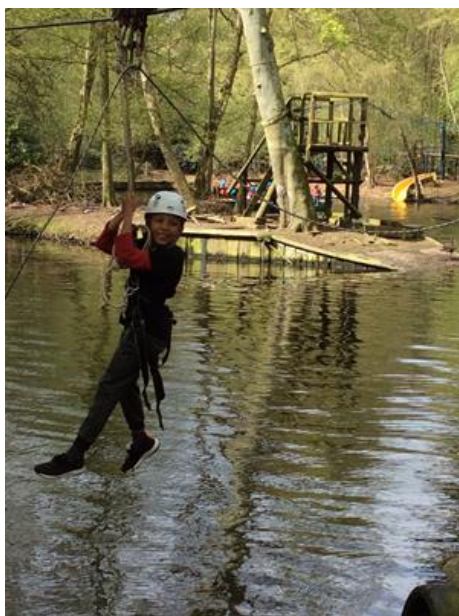
Zip-lining across the lake

The school recognises the importance of residential experience in developing the children's independence, self-confidence and social skills. We are committed to the idea that, during their lives with us, every child will be given the opportunity to take part in a short residential learning opportunities.