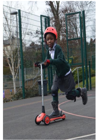
Keeping Fit & Exercising with Scoot Fit

We aim to make the teaching of each subject vivid and interesting so that all of our children build a real enthusiasm for learning.