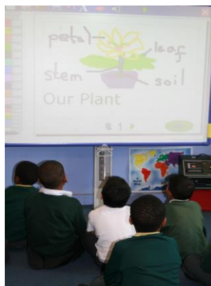
All of our classrooms have Interactive White Boards