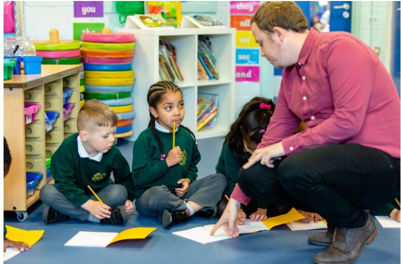
Developing a secure foundation of Phonics skills for our children in Reception

Children are given careful feedback about how successful their learning is. This feedback is both verbal and in written marking. Teachers and Teaching Assistants ensure that children are given additional challenges to take their learning further or, where necessary, misunderstandings are explored and support and practice are arranged.