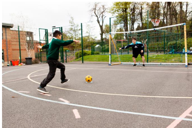
Much of our P.E. is taught by specialist coaches

The approach is very practical with children involved in a lot of “doing”. We believe that this helps them to get involved in their learning and to remember it more effectively.