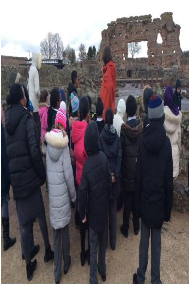
Learning about Romans at Wroxeter Roman City

On our website we provide our parents and carers a Curriculum Overview for each topic, so that they have a good idea of what their children will be learning and how they can help to support their children.