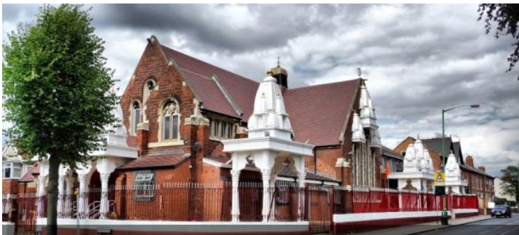
Y5 children visit the Shree Geeta Bhawan Hindu Temple

Through R.E. our children learn about their own religion (if they are a member of a faith) and other people's religions. They learn to understand and respect one another's religious backgrounds.